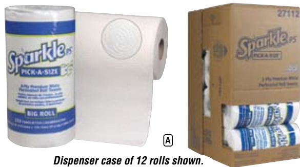
Dispenser case of 12 rolls shown.