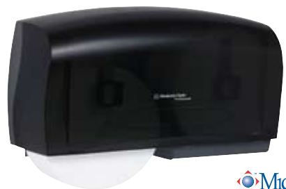
For coreless rolls.