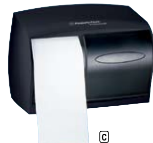
Dispenses coreless rolls.