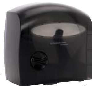
For coreless rolls.

The first electronic bath tissue dispenser!